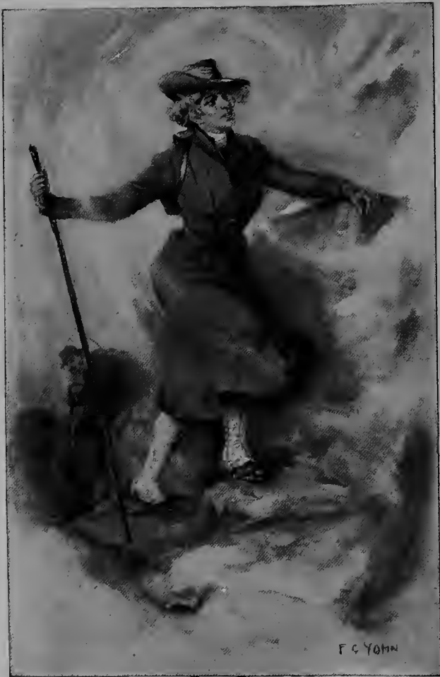
SHE BLEW THROUGH THE GAP OF THE PASS IN A WHIRLWIND OF VAPOR