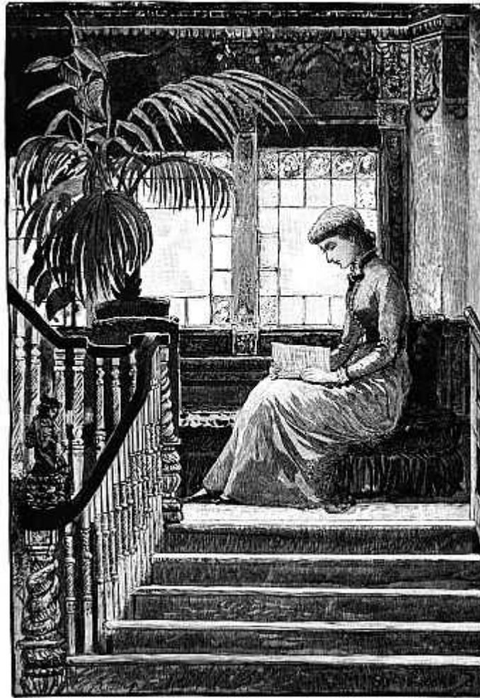
THE STAIRCASE WINDOW.

Her dressing finished, Candace went softly downstairs. She paused at the staircase window to look out. Cousin Kate's storm had not come after all. The day was brilliantly fair. Long fingers of sunshine were feeling their way through the tree-branches, seeking out shady corners and giving caressing touches to all growing things. A book lay on the window-bench. It was "A York and a Lancaster Rose," which little Marian had been reading the night before. It looked interesting, and, seeing by a glance at the tall clock in the hall below that it was but a little after seven, Candace settled herself for a long, comfortable reading before breakfast.