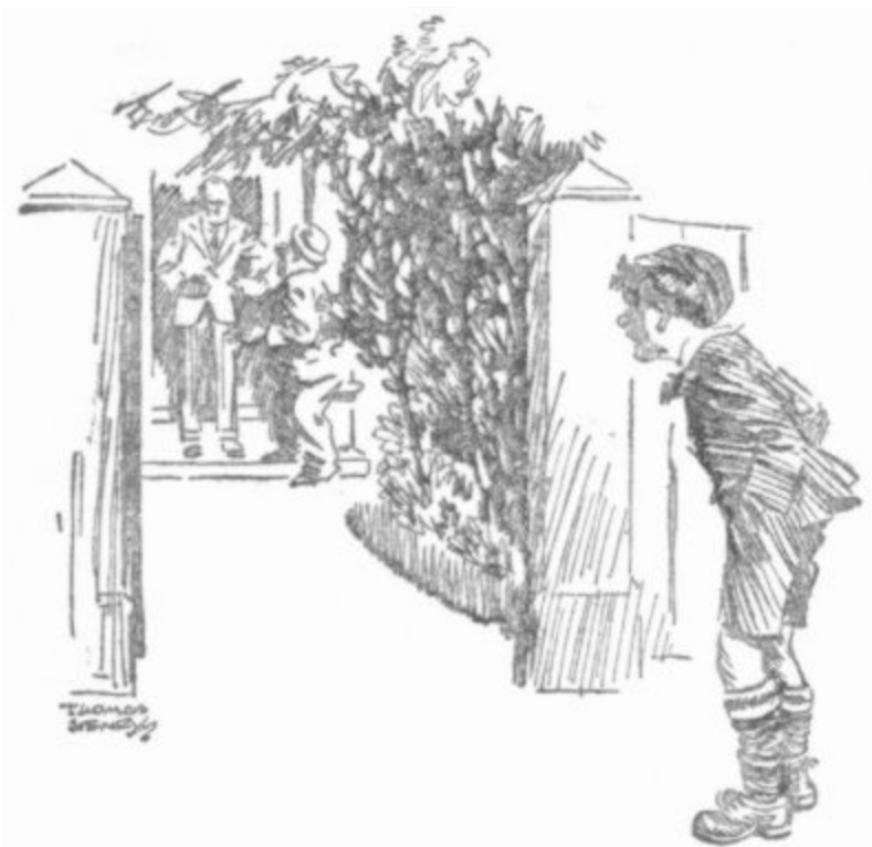
WILLIAM'S SPIRITS SANK A LITTLE AS HE APPROACHED THE GATE. HE COULD SEE THROUGH THE TREES THE FAT CARAVAN-OWNER GESTICULATING AT THE DOOR.

William decided that all things considered it was best to make a day of it.