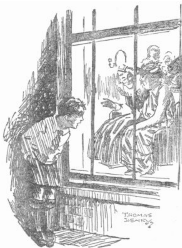
MR. LAMBKIN SAT, MISERABLE AND DEJECTED, AND YET WITH A CERTAIN PATHETIC

And Mr. Lambkin sat, miserable and dejected and yet with a certain pathetic resignation. For what can one do against Fate? Then the President caught sight of William and approached the window.