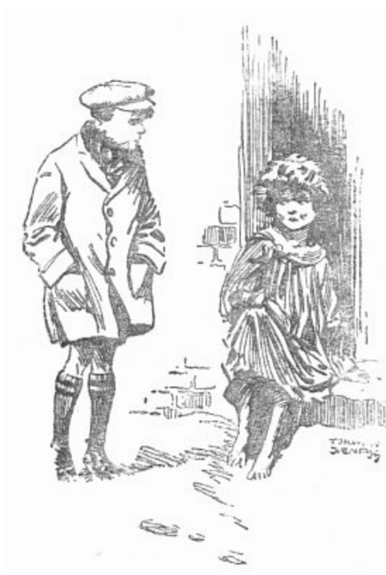
"GARN! SWANK!" WILLIAM TURNED WITH A DARK SCOWL.