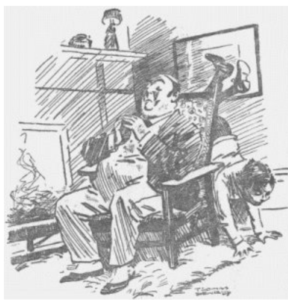
WILLIAM WAS ON THE FLOOR BEHIND UNCLE GEORGE'S CHAIR ENDEAVOURING TO TURN A SOMERSAULT IN A VERY RESTRICTED SPACE.

"Boisterous! Boisterous!" he murmured disapprovingly. "You should combine the gentleness of a Moore with the courage of a Wellington, William."