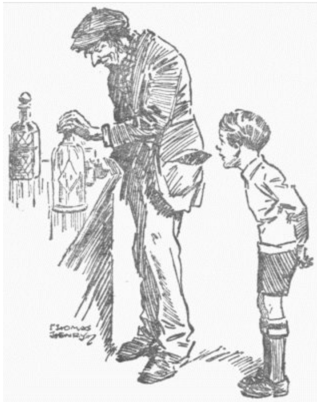
MR. BLANK MADE HIMSELF QUITE AT HOME.

Mr. Blank did. He emptied Mr. Brown's cigar-box into his pocket. He drank three glasses of Mr. Brown's whiskey and soda. While William's back was turned he filled his pockets with the silver ornaments from the mantel-piece. He began to inspect the drawers in Mr. Brown's desk. Then: