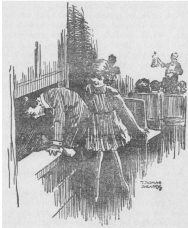
FEW NOTICED WILLIAM'S EXIT BY THE WINDOW, FOLLOWED BY THE BLINDLY OBEDIENT JOAN.

"You wait!" he whispered in the darkness of the garden. She waited, shivering in her little white muslin dress, till he returned from the stable wheeling a hand-cart, consisting of a large packing case on wheels and finished with a handle. He wheeled it round to the open French window that led into the dining-room. "Come on!" he whispered again.