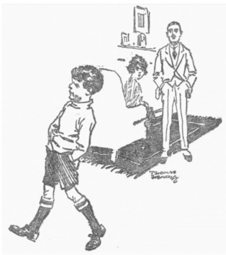
WILLIAM DEPARTED WITH AN AIR OF SCOWLING MYSTERY, LEAVING HIS PARENTS SPEECHLESS WITH AMAZEMENT.

William readily complied, and the strange couple gradually wended their way along the road towards William's house. William stopped at the gate and considered deeply. He was torn between instincts of hospitality and a dim suspicion that his family would not afford to Mr. Blank that courtesy which is a guest's due. He looked at Mr. Blank's old green-black cap, long, untidy hair, dirty, lined, sly old face, muddy clothes and gaping boots, and decided quite finally that his mother would not allow him in her drawing-room.