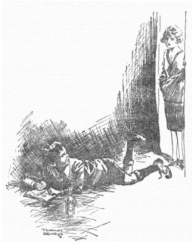
ETHEL APPEARED IN THE DOORWAY. " MOTHER WANTS YOU," SHE ANNOUNCED.

"He's reading some old book in the barn," he heard her announce, "and he says——"