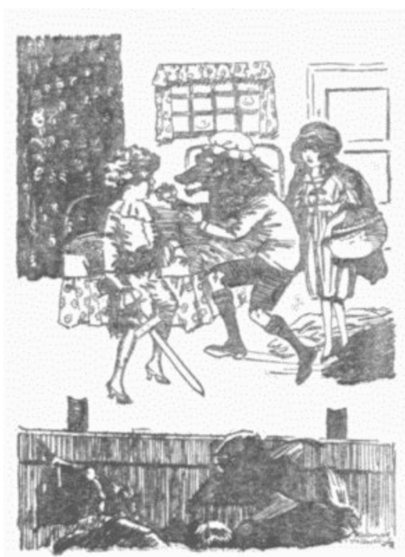
THE SIGHT OF THE HATED CUTHBERT ABOUT TO EMBRACE HIS JOAN GOADED WILLIAM TO TEMPORARY MADNESS.

Mrs. de Vere Carter had filled Red Riding-Hood's basket with packages of simple groceries, which included, among other things, a paper bag of flour and a jar of jam.