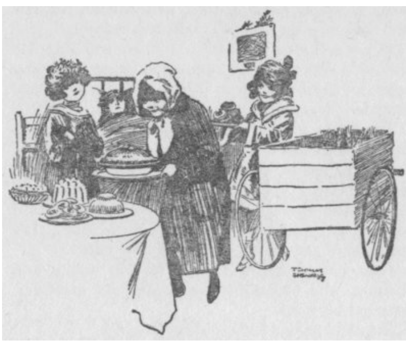
FIRST THE JELLIES AND BLANC MANGES—THEN THE MEAT PIES AND TRIFLES.

"Oh, oh!" she cried. "It's Father Christmas and a fairy!"