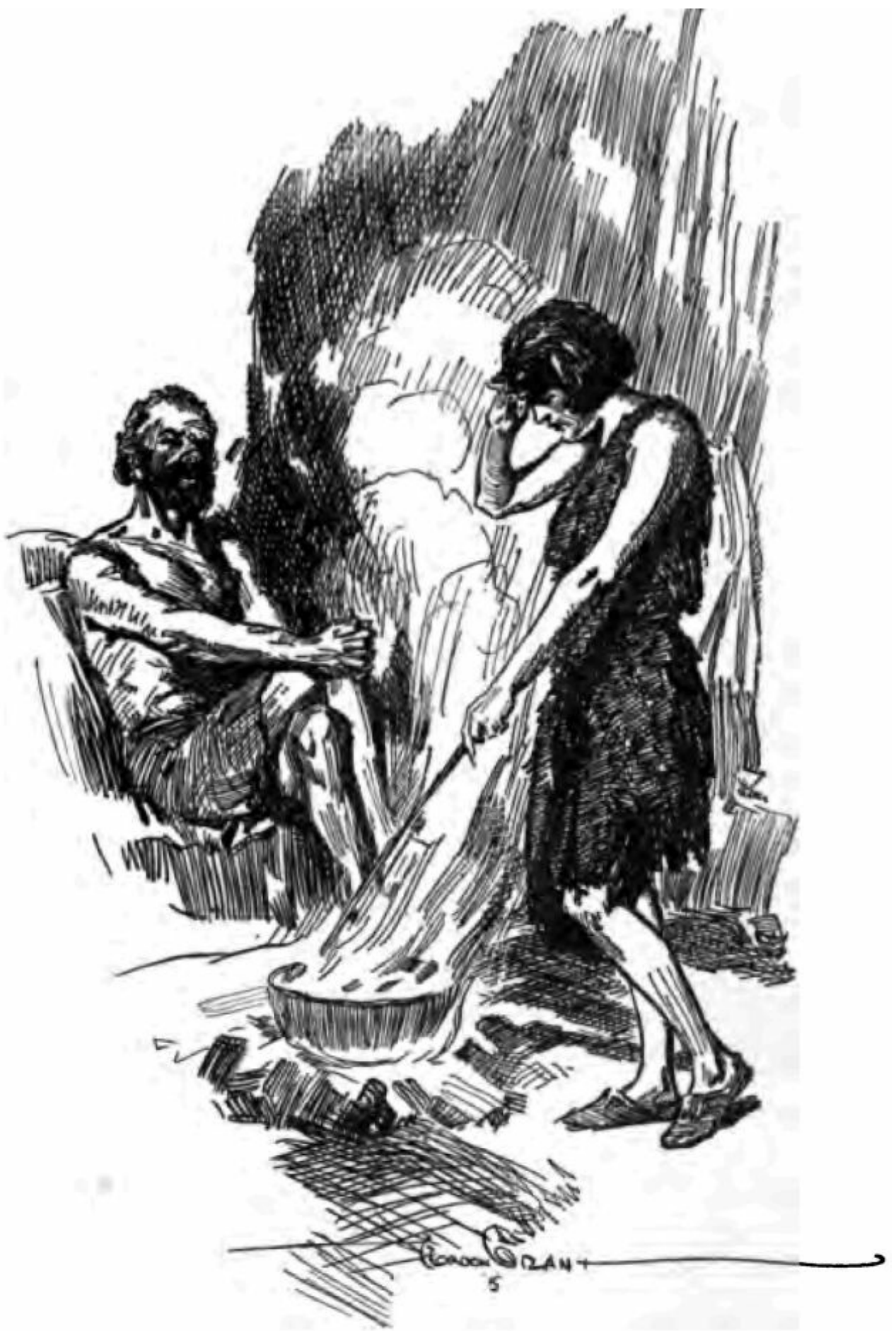
“THERE SHE WAS BOILING FISH-CHOWDER IN A SOOT- COVERED POT”