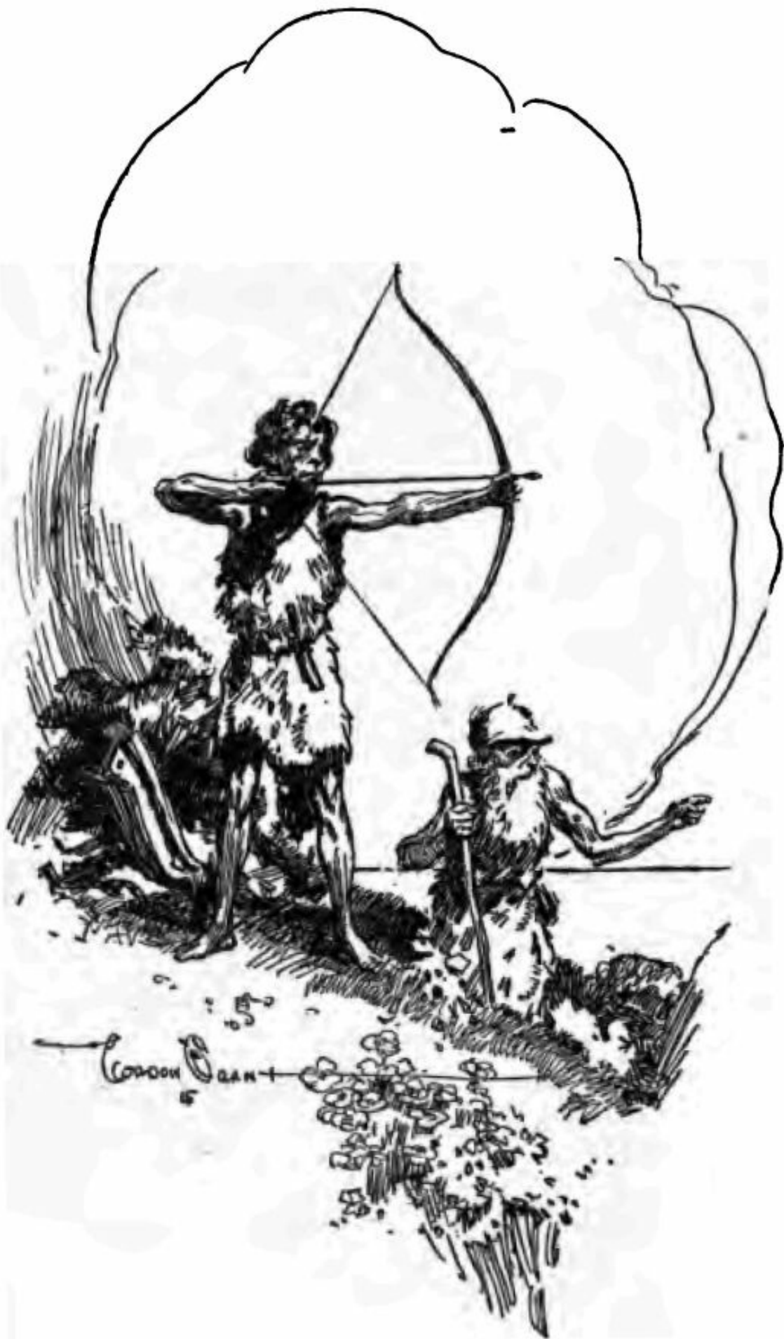
SLOWLY HE PULLED THE BOWSTRING TAUT