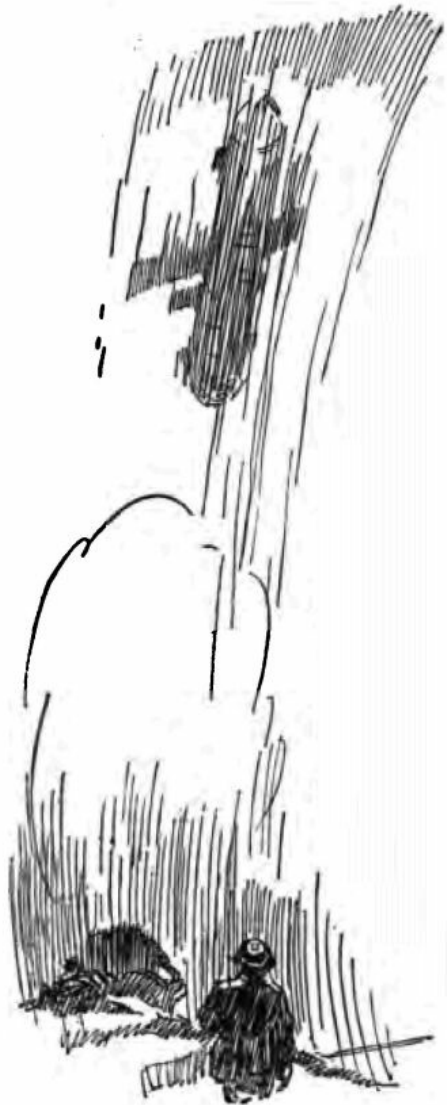
“ SHE FELL LIKE A PLUMMET TO THE EARTH ”

"That night, the second of our march, we camped beyond Haywards in the first stretches of country. And in the morning there were eleven of us that lived. Also, during the night, Wathope, the professor with the wounded leg, deserted us in the motor car. He took with him his sister and his mother and most of our tinned provisions. It was that day, in the afternoon, while resting by the wayside, that I saw the last airship I shall ever see. The smoke was much thinner here in the country, and I first sighted the ship drifting and veering helplessly at an elevation of two thousand feet. What had happened I could not conjecture, but even as we looked we saw her bow dip down lower and lower. Then the bulkheads of the various gas-chambers must have burst, for, quite perpendicular, she fell like a plummet to the earth.