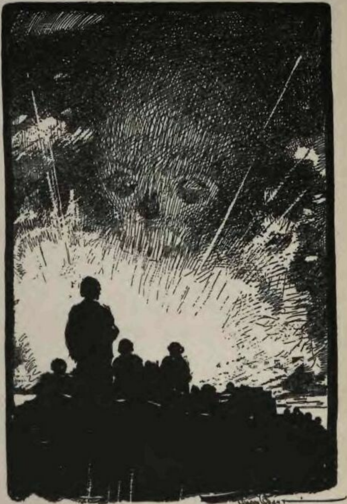
ALL THE WORLD SEEMED WRAPPED IN FLAMES