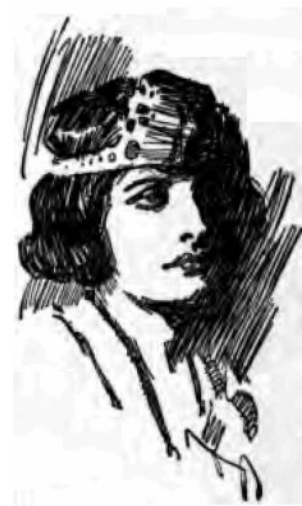
"VESTA, THE ONE WOMAN"

while hundreds of millions, yea, billions, of better men were destroyed.