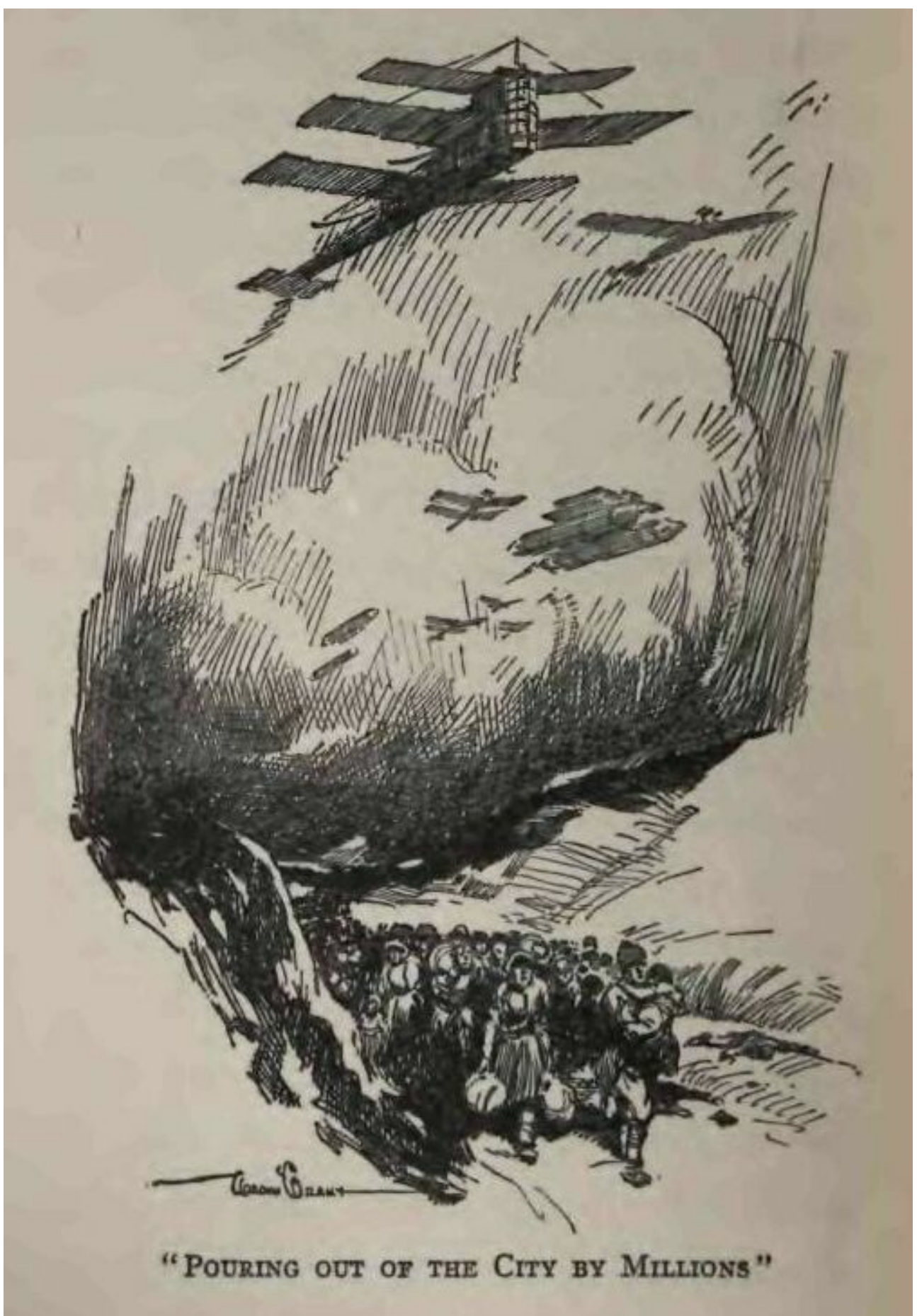
"POURING OUT OF THE CITY BY MILLIONS"

"The man who sent this news, the wireless operator, was alone with his instrument on the top of a lofty building. The people remaining in the city—he estimated them at several hundred thousand—had gone mad from fear and drink, and on all sides of him great fires were raging. He was a hero, that man who staid by his post—an obscure newspaperman, most likely.