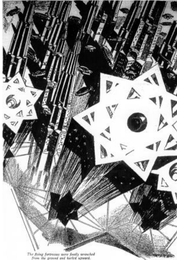
The flying fortresses were finally wrenched from the ground and hurled upward.