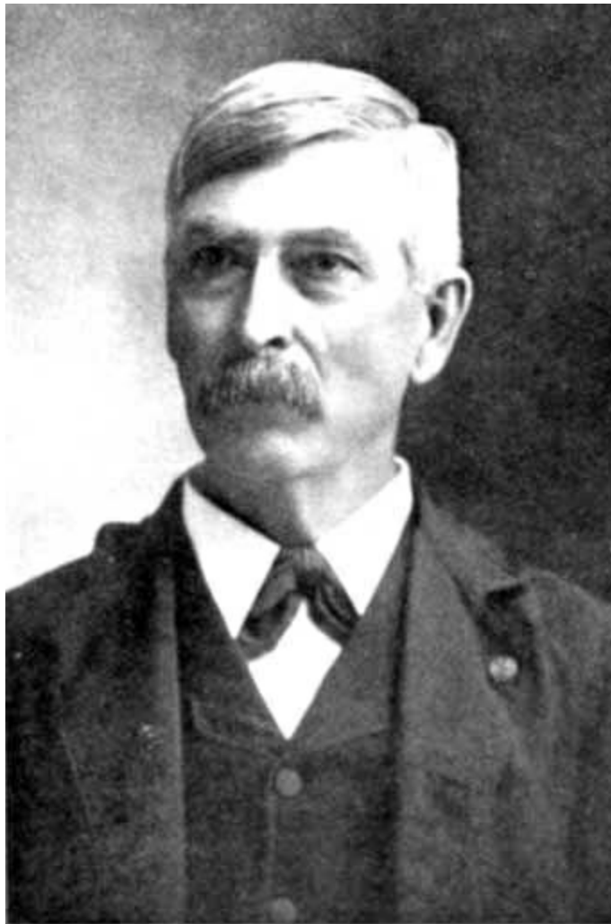
JUDGE LEANDER STILLWELL December, 1909.