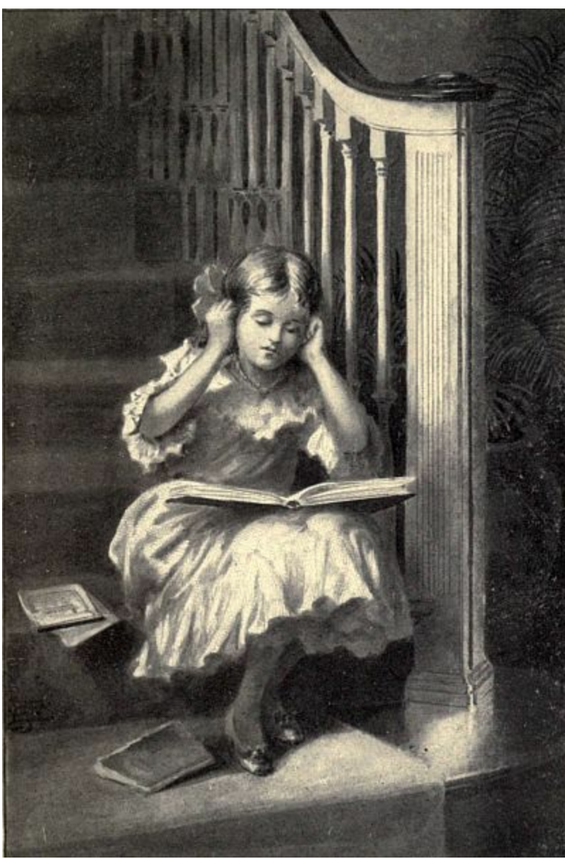
"THE PLAN WORKED LIKE A CHARM."

"Not if you put your mind on it. Your lips have been saying it over and over, but your thoughts seem to be miles away."