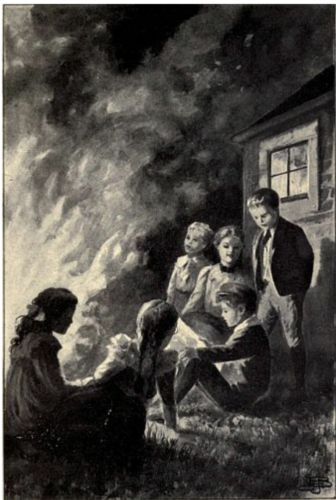
"THE PICTURE PASSED AROUND THE CIRCLE."

"Maybe we've got it at home," said Grace, eagerly. "We've taken the Harper's Weekly for years, and there is a pile of them in the attic. Some of them have been lost or torn up, but if I can find the picture I'll bring it over. What did Betty say is the date of that number?"