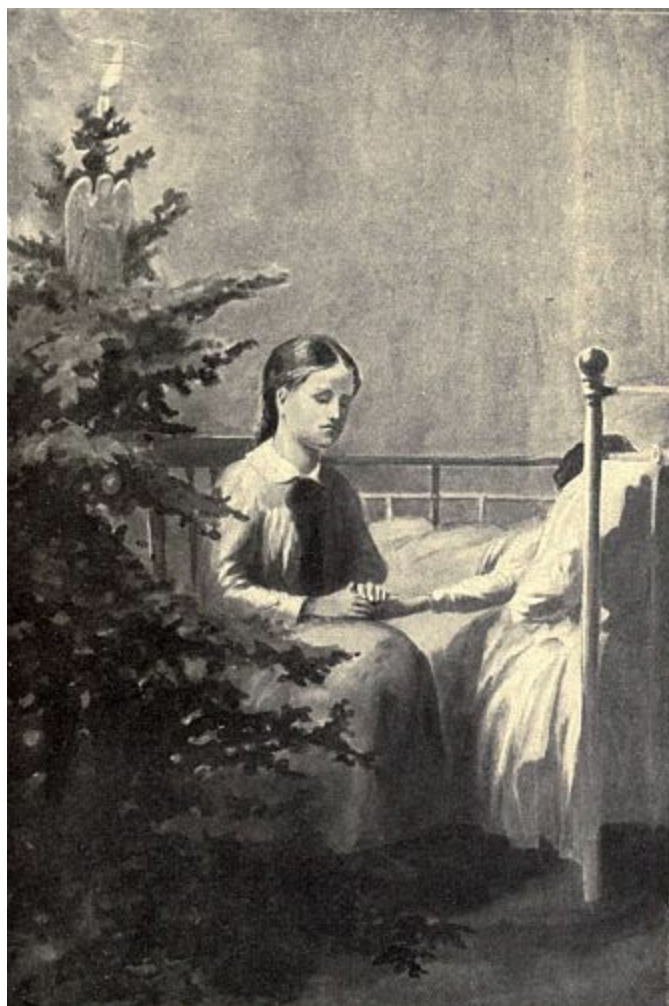
"THE LITTLE HAND HELD HERS."

Allison's gifts did not make such a brave showing when spread out with the others, but she thought of the little white room at the hospital with a warm glow in her heart that was worth more than all the gifts that money could buy. Down in the toe of her stocking she found a box from her Aunt Allison, and took it back to bed with her to open. Inside the jeweller's cotton was a little enamelled pansy of royal purple and gold, and in the centre sparkled a tiny diamond like a drop of dew. "Mamma must have told her," thought Allison, as she read the greeting written on the card with it. "For my dear little namesake. May your whole lifetime blossom with such beautiful thoughts for others as has made this Christmas day a joy."