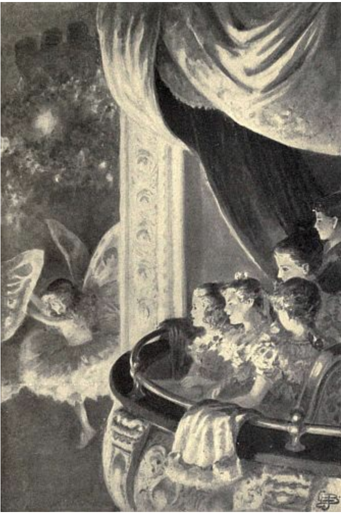
THE BUTTERFLY CARNIVAL.

It was with a view to impressing Eugenia with the elegance of her friends, that Lloyd noticed every detail of the beautiful luncheon. She intended that Eugenia should hear about it all. Gay butterflies, so lifelike that one could not believe that human hands had made them, were poised everywhere, on the flowers, the candle-shades, the curtains. The menu cards were decorated with them, the fine hand-painted china bore swarms of them around their dainty rims, and even the ices were moulded to represent them. The little hostess herself, fluttering around among her guests as gracefully as if she too were a winged creature, wore a gauzy dress of palest blue, embroidered in butterflies, and there were butterflies caught here and there in her golden curls.