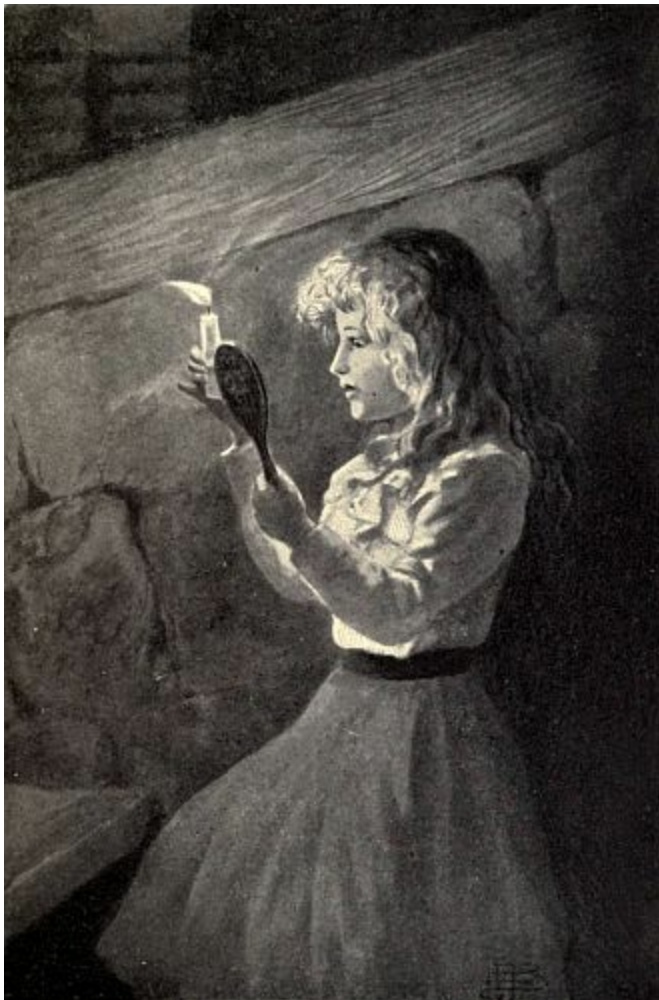
"SHE BEGAN THE OLD RHYME."

"Isn't he a dandy!" exclaimed Rob, putting the slouched hat on the pillow head at a fierce angle, and fastening the military cape up around the chin as far as possible. "Come on now, Kitty, let us make our escape before anybody comes."