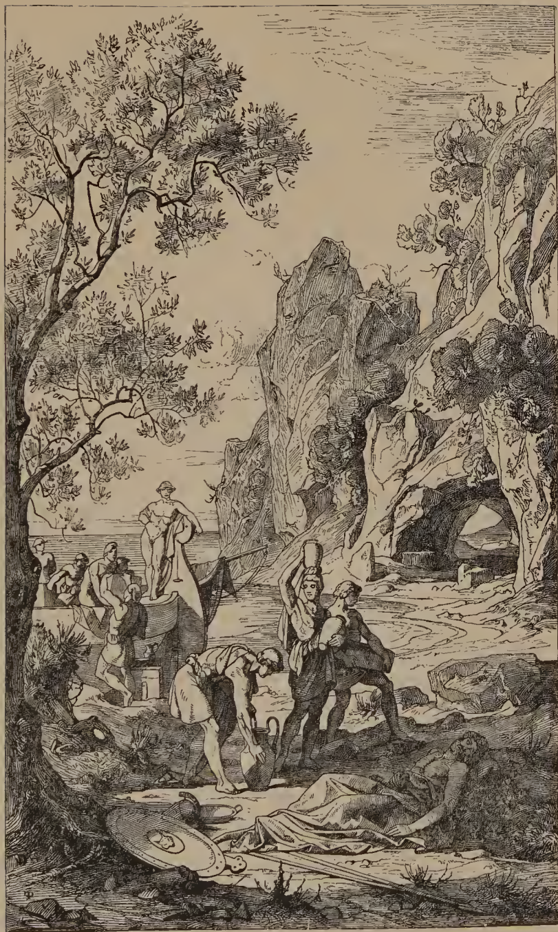
Ulysses Awakens in Ithaca.