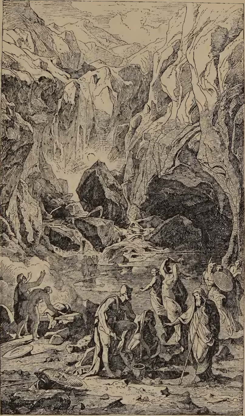
Ulysses in Hades.