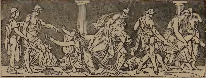
Ulysses slays the suitors of Penelope.