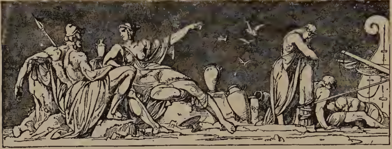
Circe Warns Ulysses of the Sirens.