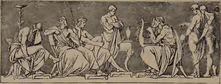
The Song of Demodocus.