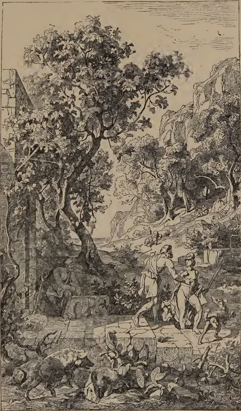
Ulysses and the Goddess Minerva.