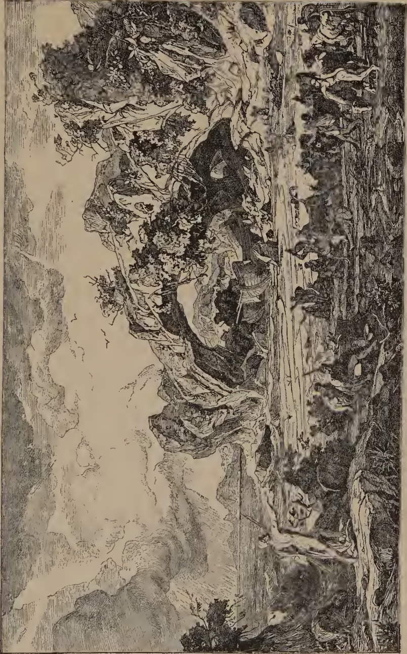
The Followers of Ulysses Slay the Oxen of Apollo.