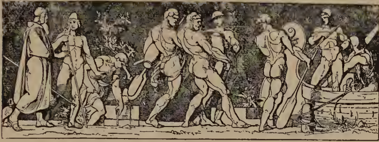
Ulysses Going Forth on his Travels.