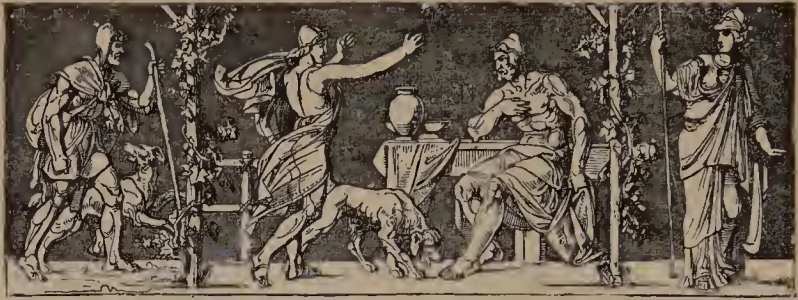
The transformation of Ulysses by Minerva.