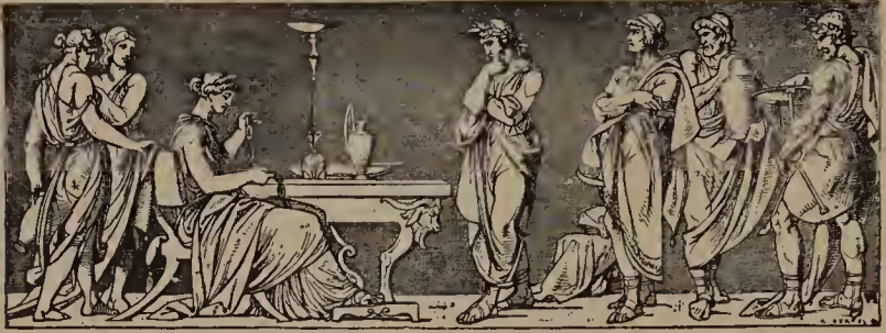
The Suitors of Penelope.