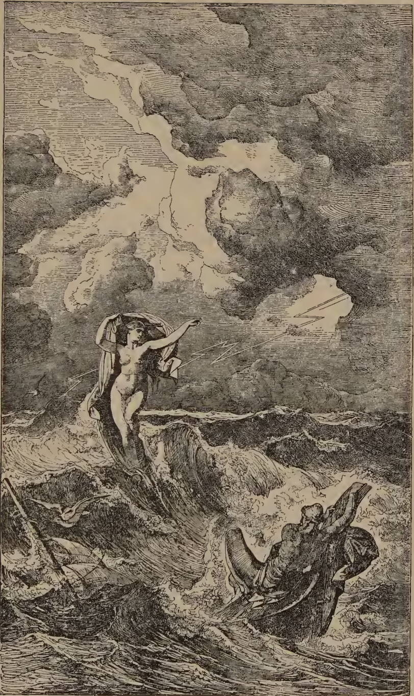
Leucothea Rescues Ulysses.