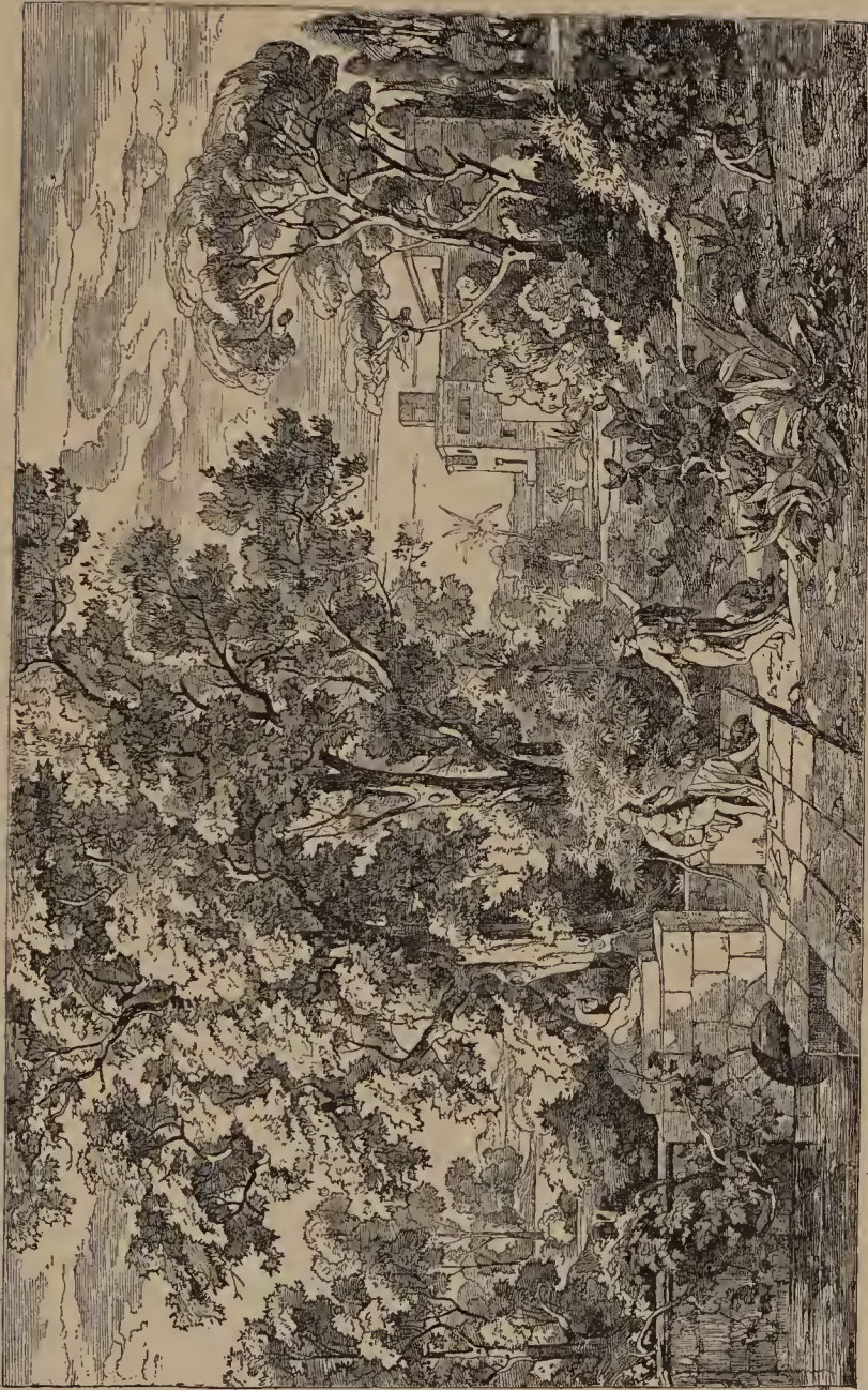
Mercury Instructing Ulysses how to Resist Circe.