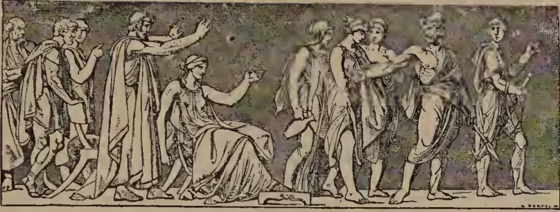
Ulysses Departs from Calypso and Embarks for Ithaca.