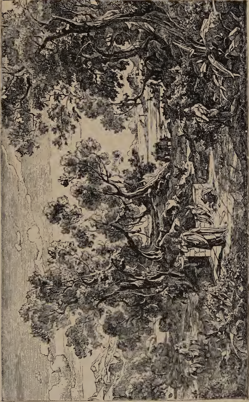
The Princess Nausicaa and Ulysses.