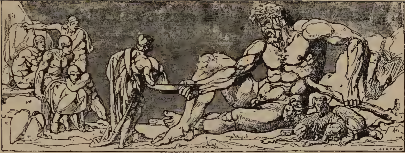
Polyphemus and the Followers of Ulysses.