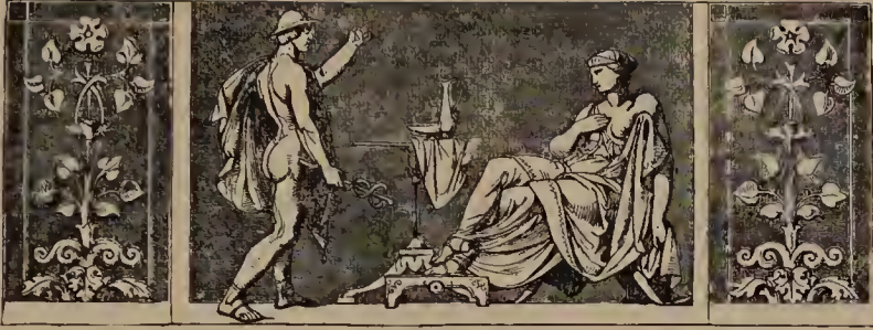
The Warning of Mercury to Circe.