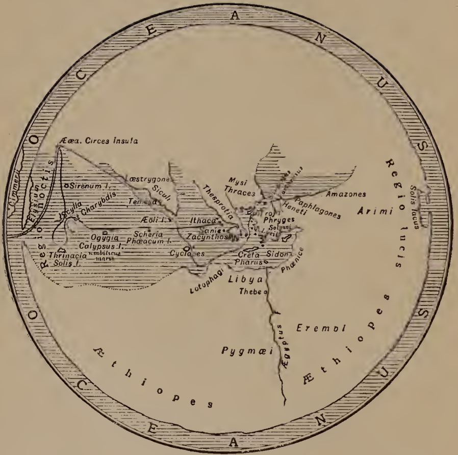
Map of the Wanderings of Ulysses.