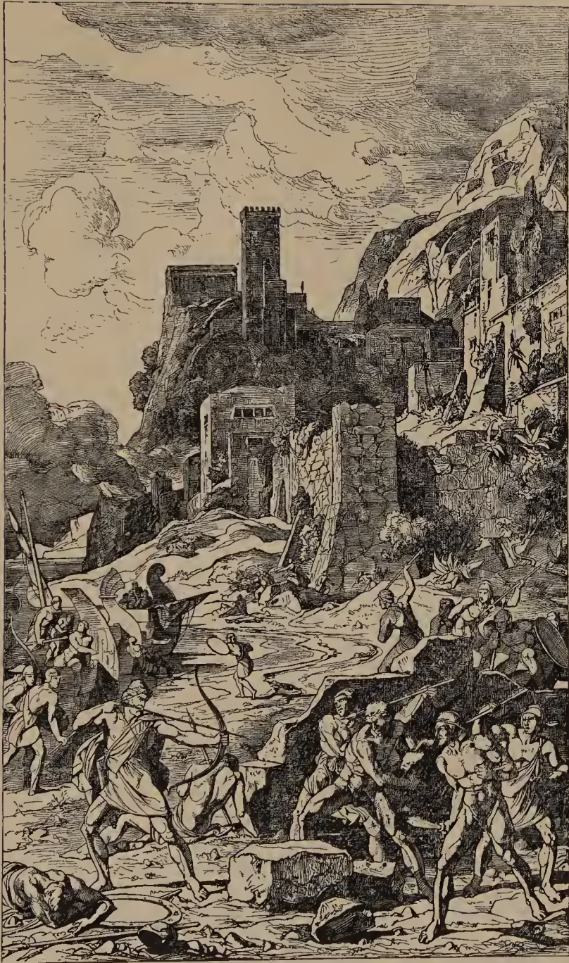
Conquest of Ismarus, Capital of the Ciconians.