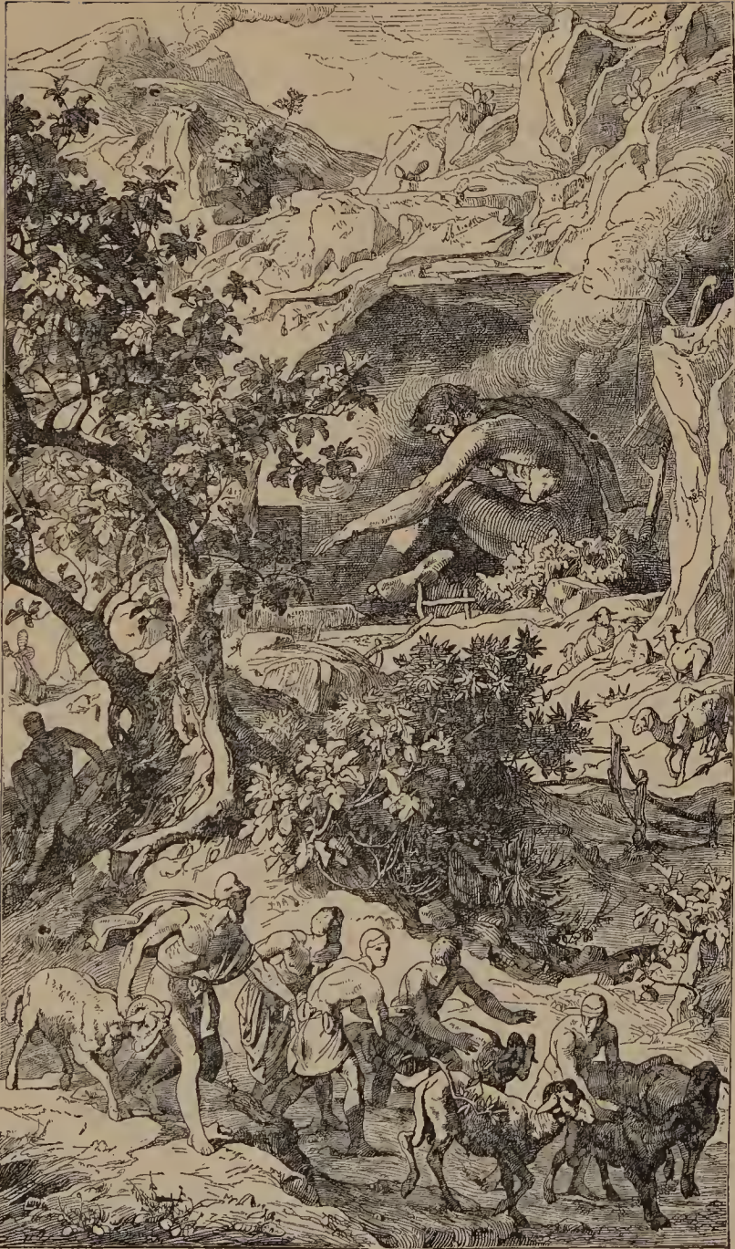
Escaping from Polyphemus.