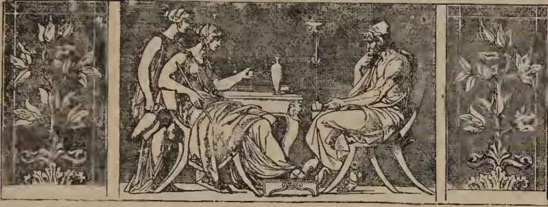
On the Island of Calypso.