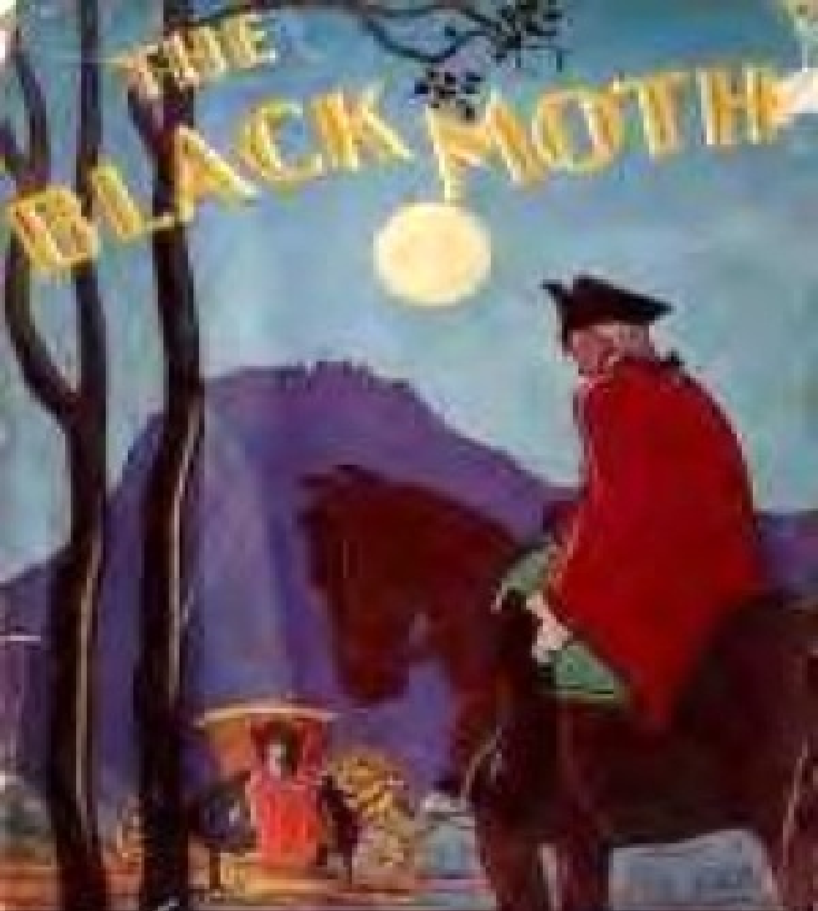
BY GEORGETTE HEYER